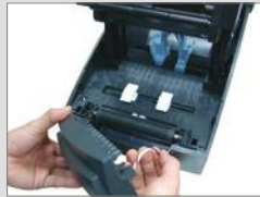
Auto-Cutter : Easy installation