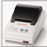
Small Footprint STP-103II 116X180X90(W X L X H mm)

STP-103II occupies a small space effectively. It is perfectly suited for EFT POS applications and Hospitals and Medical Centers as well. STP-103II is used for various applications and one of the most flexible thermal printer ever.