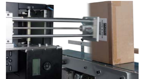
Versatile, applying labels top, bottom or sides at any rotation

Toshiba technology enables real world and dramatic reductions in operating costs. The APLEX4 module works in conjunction with the B-EX4 printers series, with options like the automatic ribbon saving and improved technologies that reduces by almost 70% the energy consumption in standby mode when compared to its predecessor. The dual motor ribbon drive removes wrinkles in the ribbon and so reduces paper and ribbon waste. These special features reduce the total operating costs while helping to preserve the environment.