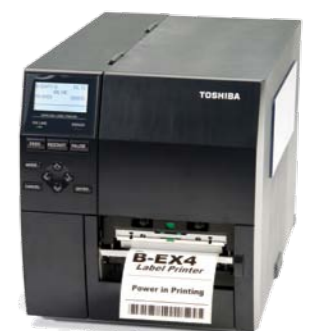
B-EX4 a superior range of industrial printers at midrange price for a wide variety of applications