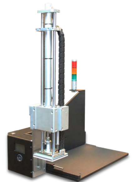
Easy installation, plug & play accessory for the B-EX4 printers series

The piston remains in the up position even if the air is closed.